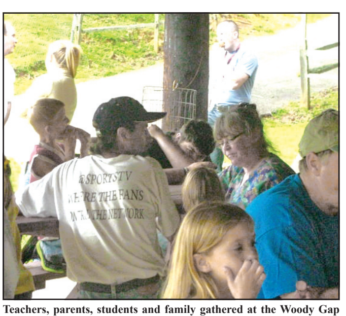
School for the annual Back to School Bash. had been set up by Basketball

dent Council provided hot dogs and buns; while parents, faculty and community members donated delicious side dishes and desserts. The Gaddistown