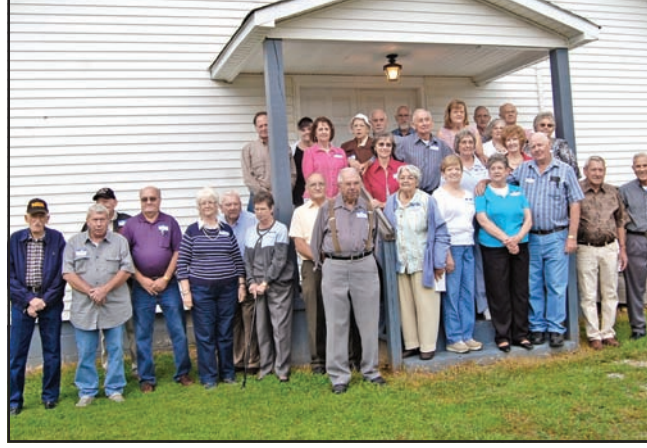
More than 50 members of the Bunker Hill School gathered Saturday for a reunion of the now defunct school on Highway 76.

The school, for students in grades 1 through 7, opened