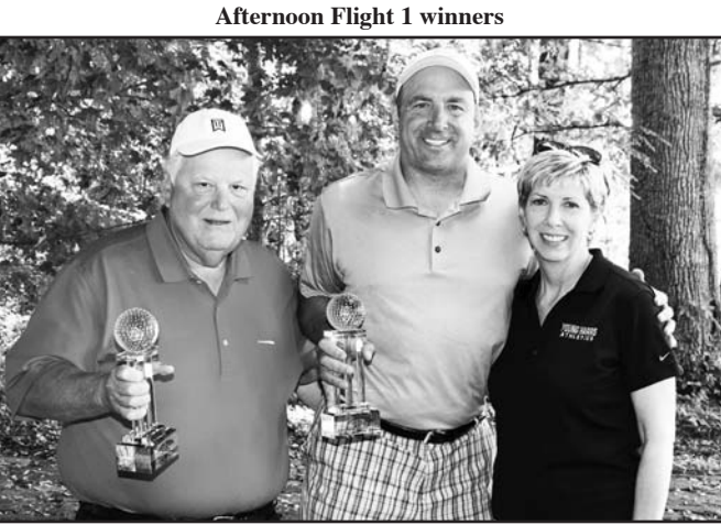
Flight 2 morning winners