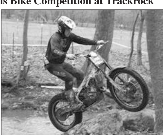
Bikes and bikers will be competing

The Southeastern Trials Riders Association (STRA) is a group of members located in 7 southeastern U.S. states. They are dedicated to the exciting and family friendly sport of Observed Motorcycle Trials. They cater to both the serious competitor and the casual or fun rider. The competition schedule consists of 12 or more STRA championship events with classes for modern and vintage bikes. NT(Feb24,Z18)gg