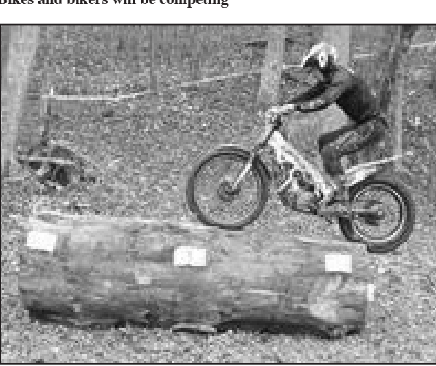
Participants must possess extraordinary balance and agility skills